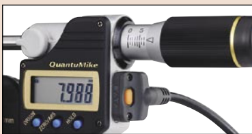
Measurement data output function is available with a water-resistant connection cable.