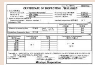
Certificate of inspection