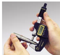
The time needed to measure 6 diameters on a workpiece, from the smallest to the largest with the micrometer held in one hand, was recorded for a conventional digital micrometer and for the QuantuMike