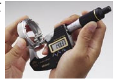
Ratchet on thimble Ratchet on speeder

*Patent registered (in Japan, USA, China, Germany, UK, and France)